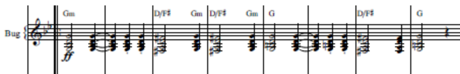
SLIKA 10: Dionica bugarije na početku transkripcije.

Prema: http://hz.imslp.info/files/imglnks/usimg/3/37/IMSLP225698-SIBLEY1802.17317.a03c-39087009471030score.pdf