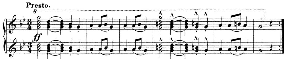
SLIKA 4: Primjer hemiole na samom početku skladbe.

Slavenski ples br. 8 napisan je u g – molu u tempu Presto i predstavlja osmi ples u prvoj zbirci Dvořákovih plesova. Jedan je od najpopularnijih i najizvođenijih plesova. Dvořáku je inspiracija za ovaj ples bio češki brzi vatreni ples zvan Furiant . Furiant je ples za u \frac{3}{4} mjeri s karakterističnim ritmom hemiole 1 .