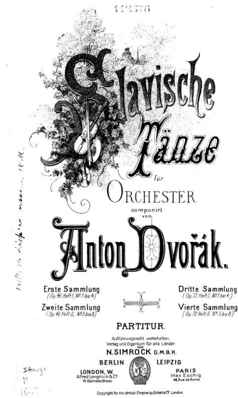
SLIKA 2: Naslovna stranica partiture za orkestar (op. 72)