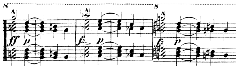
SLIKA 5: Drugi primjer hemiole na početku Code