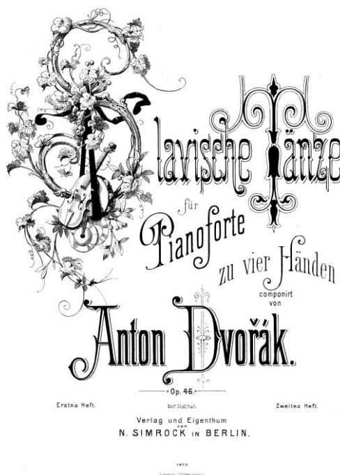
SLIKA 2: Naslovna stranica partiture za klavir četveroručno (op. 46)

Slavenski plesovi su zbirka od šesnaest skladbi koje je skladao Antonín Dvořák 1878. i 1886. godine. Slavenski plesovi pripadaju najpoznatijim Dvořákovim djelima skladanima za glasovir četveroručno, prije nego što ih je skladatelj preradio za orkestar na zahtjev njemačkog izdavača Fritza Simrocka. Simrock je nakon izdavanja skladbe Zvuci iz Moravske odmah tražio od Dvořáka nove skladbe. Nakon velikog uspjeha Mađarskih plesova Johanna Brahmsa među amaterskim glazbenicima Simrock je prepoznao što publika voli i želi te je predložio Dvořáku kakve skladbe da napiše. Nadahnuti Mađarskim plesovima Johanna Brahmsa, Slavenski plesovi su sabrani u dva niza od osam plesova koji nisu povezani ni tematskom građom ni tonalitetom. Brahmsove plesove Dvořák je uzeo samo kao model, postoje bitne razlike između ta dva djela. Brahms je za svoje plesove iskoristio već postojeće mađarske narodne melodije dok je Dvořák koristio samo karakteristične ritmove slavenske folklorne glazbe. Melodije su bile potpuno njegove. Nedugo nakon što ga je Brahms preporučio Simrocku Slavenski plesovi su postali izrazito popularni diljem Njemačke, a nakon toga i diljem cijelog svijeta pa su tako bili izvođeni u eminentnim koncertnim dvoranama i gradovima poput Dresdena, Hamburga, Nice, Berlina, Londona, New Yorka, Bostona te dakako Praga.