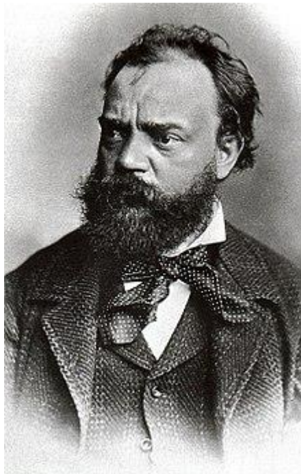
SLIKA 1: Antonín Leopold Dvořák Prema:

pjesama“ (Michels, 2006; str. 495). Nadalje, 1895. godine vraća se u domovinu gdje ponovno postaje profesor kompozicije, a nedugo zatim i rektor Praškog konzervatorijuma. „Gudački kvarteti u As – duru i u G – duru, njegovi možda najličniji, najsavršeniji kvarteti, napisani odmah nakon povratka u domovinu, ujedno su posljednje kompozicije iz oblasti apsolutne muzike koje je Dvořák napisao. Otada se posvećuje isključivo operi i programskoj muzici“ (Kovačević, 1971; str. 495). Pred kraj svog života napisao je još pet simfonijskih poema (Vodnik, Polednice, Zlaty kolovrat, Holoubek i Pisen bohatyrska) i tri opere (Čert a Kača, Rusalka i Armida) čime završava svoj bogati glazbeni opus. „Njega je u prvom redu privlačio muzički (i ne samo muzički) folklor njegove zemlje; no on je u svoj široki interes obuhvatio narodno stvaranje i ostalih slavenskih naroda, o čemu, primjerice, svjedoče Slavenski plesovi. Ali – ovo je za Dvořáka veoma značajno – on skoro nikada nije posezao za gotovim citatima iz folkloru. On se najprije udubljavao u obilježja narodnih tvorevina, a zatim je, redovito uspješno, nastojao stvoriti melodije koje će i melodijskim i latentno-harmonijskim i ritmičkim osobinama pripadati proučenom folklornom području“ (Kovačević, 1971; str. 495). Dvořák je utemeljitelj češke simfonijske, koncertantne, komorne i oratorijske glazbe. Preminuo je 01. svibnja 1904. godine u Pragu od moždanog udara.