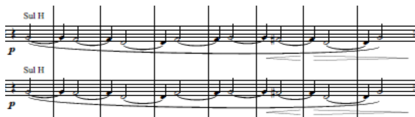
SLIKA 11: Detalj iz transkripcije gdje bračevi sviraju samo na trećoj žici.

Nadalje, rasporediti dionice iz simfonijskog u tamburaški orkestar je izuzetno zahtjevno i ne može se reći da postoji jedinstveno rješenje već se mora doskočiti svakoj partituri ili situaciji u toku skladbe na različite načine. Međutim, vrlo je jasno za neke dionice poput berde koja svira dionicu kontrabasa, flaute koju sviraju bisernice ponajviše zbog svojeg opsega, ali i boje. Nerijetko dionice bisernice obuhvaćaju i dionice trube, oboe ili klarineta, a dionice bračeva dionice violina. Tamburaško čelo svira dionice violončela ili fagota, a E brač preuzima ulogu viole iz simfonijskog orkestra. Od proširenih tehnika sviranja korišten je sul H 4 u dionicama bračeva 1 i 2.