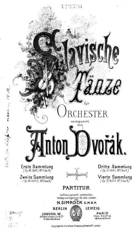
SLIKA 2: Naslovna stranica partiture za orkestar (op. 72) Prema: http://hz.imslp.info/files/imglnks/usimg/e/e7/IMSLP225700-SIBLEY1802.17317.f70d-39087009471055score.pdf

Prva zbirka od osam plesova (op. 46) nastala je 1878. godine pod nazivima: br. 1 u C – duru ( Furiant ), br. 2 u E – molu ( Dumka ), br. 3 u As – duru ( Polka ), br. 4 u F – duru ( Sousedská ), br. 5 u A – duru ( Skočná ), br. 6 u D – duru ( Sousedská ), br. 7 u C – molu ( Skočná ) i br. 8 u G – molu ( Furiant ). U ovoj zbirci plesova prevladavaju motivi iz čeških narodnih plesova osim plesa br. 2 koji je nastao prema motivima ukrajinske dumke. Nakon ogromnog uspjeha prve zbirke plesova Simrock nagovara Dvořáka na novu zbirku, međutim potonji je oklijevao jer je smatrao da je skladati istu stvar dva puta zaista teško. Simrock nije odustajao te je Dvořák nakon osam godina počeo pisati novu seriju plesova.