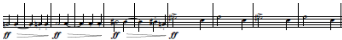
SLIKA 8: Detalj iz transkripcije. (Obratiti pozornost na frazu koja je premještena za oktavu više zbog nedostatka opsega)

Prema: http://hz.imsalp.info/files/imglnks/usimg/3/37/IMSLP225698-SIBLEY1802.17317.a03c-39087009471030score.pdf